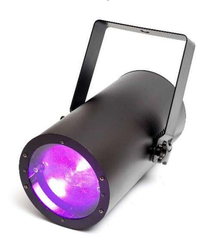
The Paint Can Pendant

The ideal pendant light. Made specifically for the installation market. Can be simply installed by an electrical contractor. 200 watts of power. Utilizing a COB led with a CRI of 95. Available in stock Warm White or RGBW, where W is 3200K. Other COB leds are available upon request such as variable white and cool white. In built electronic Zoom from 10 to 60 degrees. Control via DMX or Static (no controller needed).