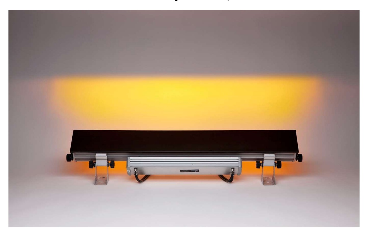
L.M. Elektrabar with glare shield for perfect cuts

Utilizing homogenized 6-in-1 leds. RGBWAI where the I is indigo (not UV); this way perfect pastels like Lee 170 Lavender are flawlessly achieved.