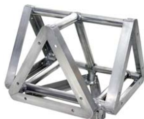
3-Way To Vertical