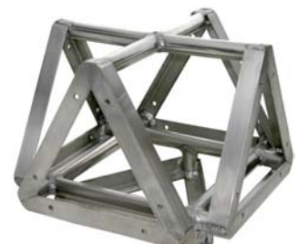
4-Way To Vertical